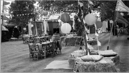
Grimsargh St Michael's Church & School Garden Party