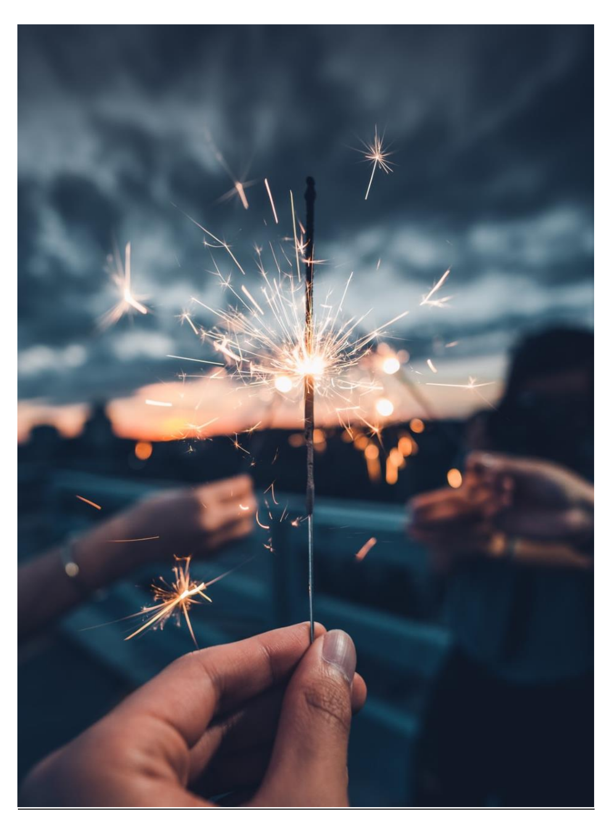
How are/ were their lives explosions of God's love?